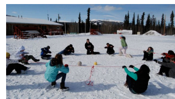
Band Retreat, Team Building Exercise

The goal of the ACBS Sponsorship Program is to form a partnership that will benefit both your business and our organization. In return for your financial and/or in-kind support, we will endeavour to provide your business with exposure, recognition and benefits through our events, advertising, marketing and media opportunities.